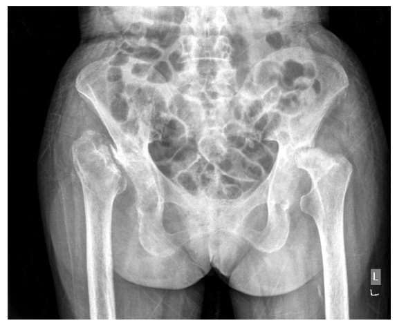
FIG1:Radiograph,TB arthritis of Left hip.

MRI of pelvis and spine was done. T2 weighted images of spine showed multiple level vertebral bodies and disc involvement likely to be tubercular spondylitis at cervical C5-7 and dorsolumbar D12 -L1 region (Fig.2). MRI pelvis revealed right hip pseudoarthrosis with absence of head and neck. Left hip showed pseudoarthrosis with deformed destructed head and synovial thickening secondary to infective arthropathy(Fig. 3). Anti-Tubercular Treatment (ATT) in the form of SHRZ (streptomycin, isoniazide, rifampicin, pyrazinamide) was started after the MRI.