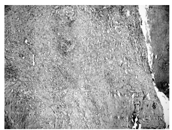
FIG4: Histopathology - granulation tissue with multiple giant cells and epitheloid cells

Head neck excision of left hip was done. Material was sent for histopathological examination, which showed granulation tissue with giant and epitheloid cells, consistent with tubercular infection (Fig. 4). Clinicoradiologically the diagnosis was almost sure and histopathology confirmed tubercular granuloma. So it was concluded that the patient had multifocal tuberculosis. PCR was not done to avoid economic burden on the patient.