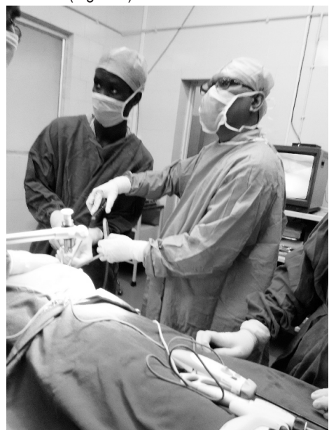
Figure 1: Single Incision Lift Laparoscopic surgery in progress

Appendicectomy is the most common abdominal operation performed on an emergency basis [1]. It is similar in African countries and is carried out for both acute and sub – acute appendicitis. In most places the surgery is carried out under spinal anesthesia using a grid iron incision over the McBurney's point. The laparoscopic technique has many advantages over conventional open surgery especially in women and obese patients [2-4]. A further refinement of the technique is the introduction of Single-incision laparoscopic surgery (SILS). It is a new technique developed for performing operations without a visible scar. SILS may further reduce the trauma of surgery leading to reduced port site complications and postoperative pain. The improved cosmetic result also may lead to improved patient satisfaction with surgery [5]. We describe the procedure of carrying out Single incision Lift laparoscopic surgery for Appendicectomy and how we can train for it. (Figure 1)