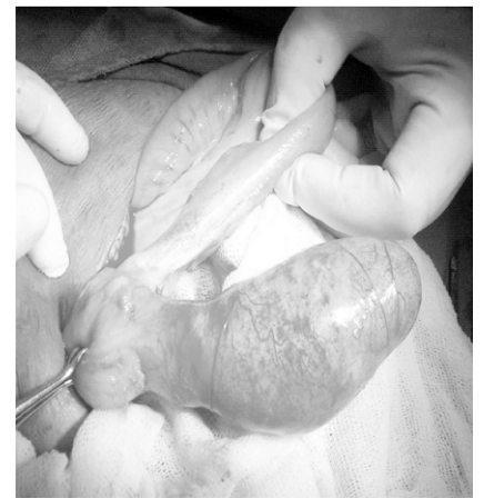
Figure 1: Intra-operative picture of the hugely distended mucocele of the appendix.

A 53 year old female, with sickle cell trait, presented to the Department of Gynecology with complaints of white discharge per vaginum and increased frequency of micturition. Her general physical examination revealed mild pallor. On abdominal examination a soft, cystic mass was palpable in her right iliac fossa which had restricted mobility and was non tender. Uterus was small and freely mobile. Her hemoglobin was 7.4. Biochemical parameters were within normal limits. Urine examination including culture studies was normal. Ovarian tumor markers were negative. CT scan was done which reported, a well defined non-enhancing, hypo dense lesion of size 11.5 x 3.5 cm in the pelvis on the right side, posterior to the uterus. Possibility of a mesenteric cyst was kept. With the diagnosis of an ovarian cyst and possibility of a mesenteric cyst the patient was explored. Intraoperatively both the ovaries were visualized and were normal. The cystic mass was a giant appendicular mucocele of size 12 x 5 cm. There was no spillage of contents and no evidence of lymph nodes or other tumours in the colon and rectum. Simple appendicectomy was performed. Patient had an uneventful post op course and on follow-up of two years has remained alright.